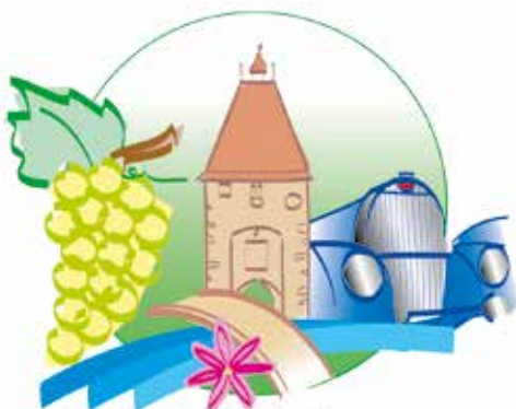
Communauté de Communes de la Région de MOLSHEIM-MUTZIG

4 cour des Chartreux 67120 Molsheim musee@molsheim.fr +33 (0)3 88 49 59 38 www.molsheim.fr