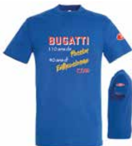
T-Shirt 110 ans S to 2XL