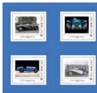
Stamps 110 ans