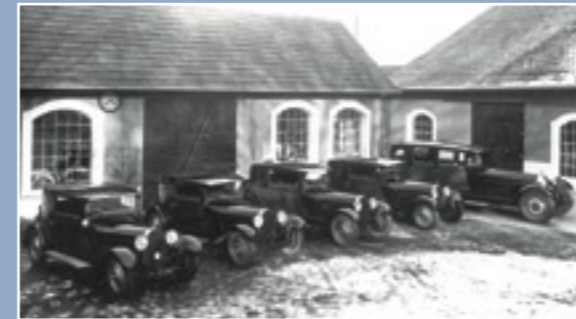
Hardtmühle around 1930

Through anecdotes recounted by the Witness, you will discover the key sites where the Bugatti car-making era began and how that tradition is continued today in other ways.